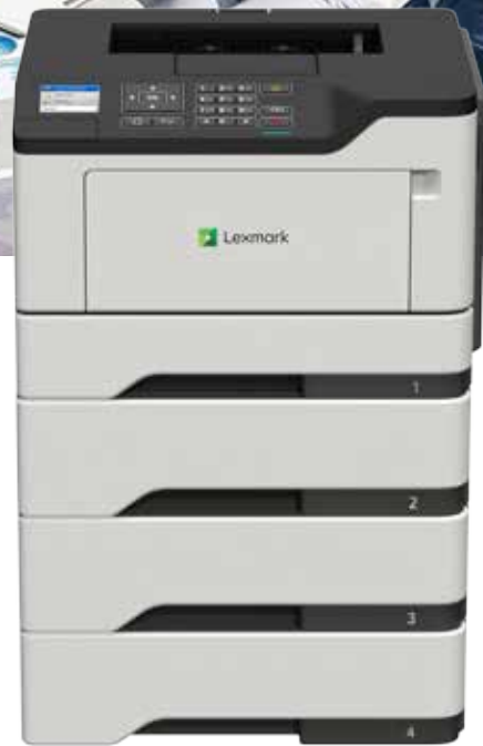
MS521dn with optional trays