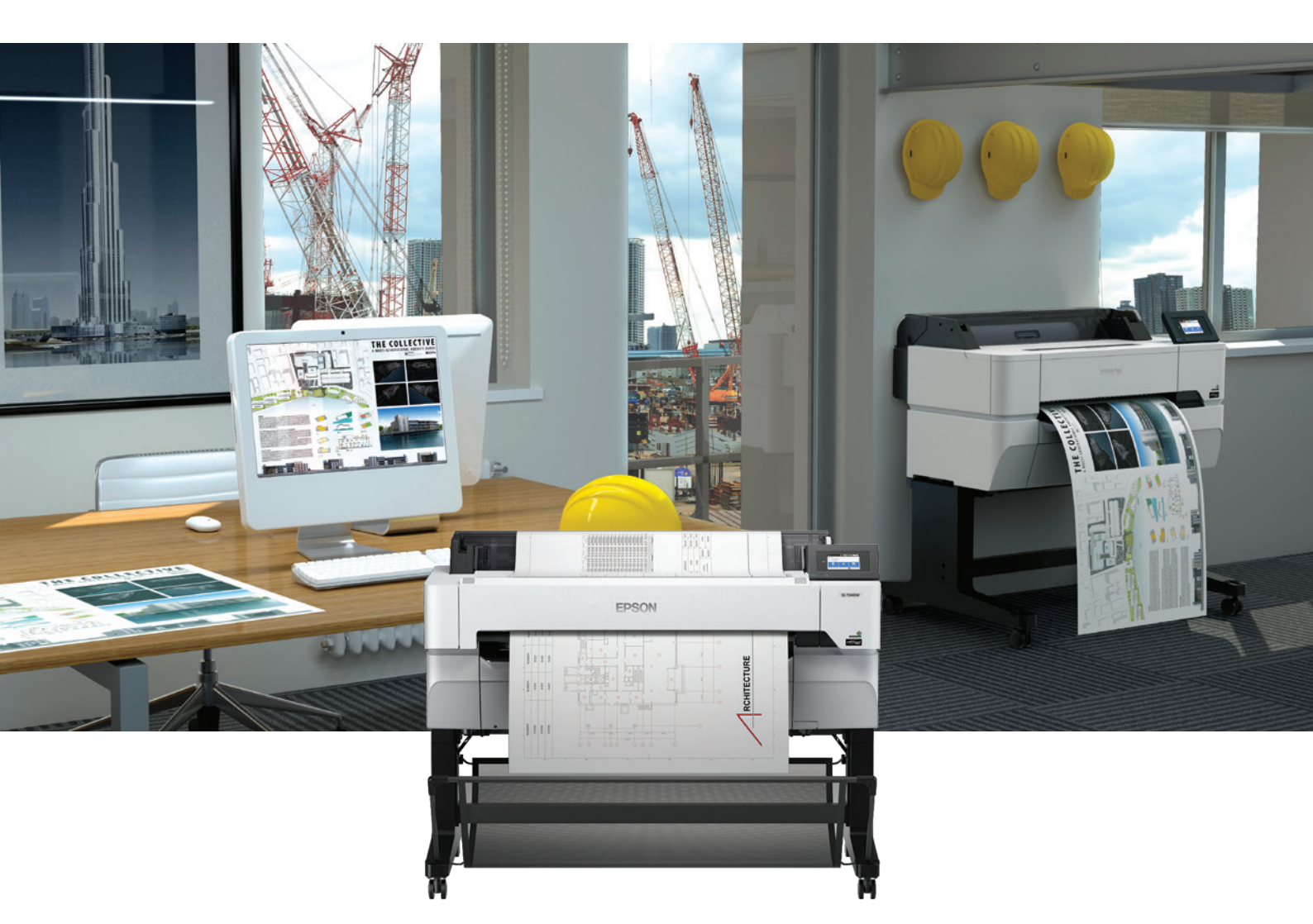
PRINT • SCAN • COPY • SHARE