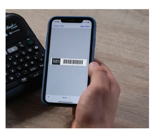
Print barcodes and other custom labels