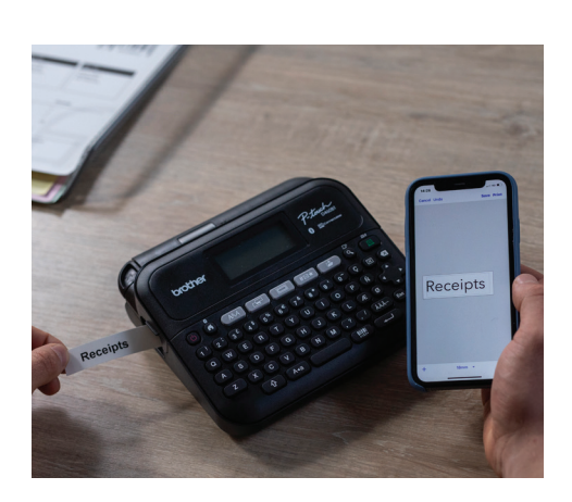
Print from your smartphone via Bluetooth